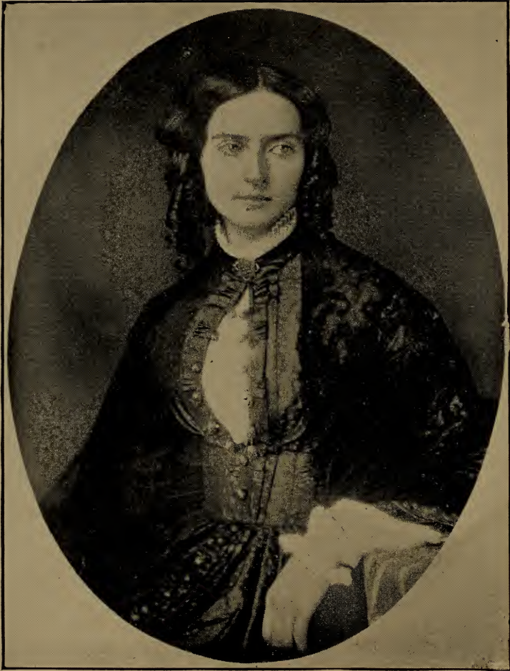
(From an Early Portrait.)