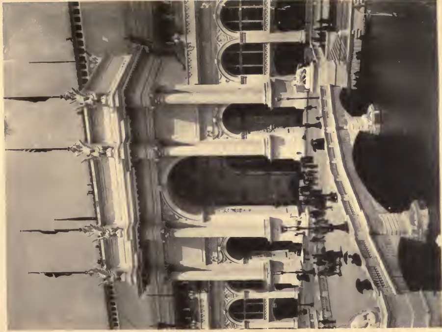
THE WEST PORTAL OF THE MANUFACTURES BUILDING.