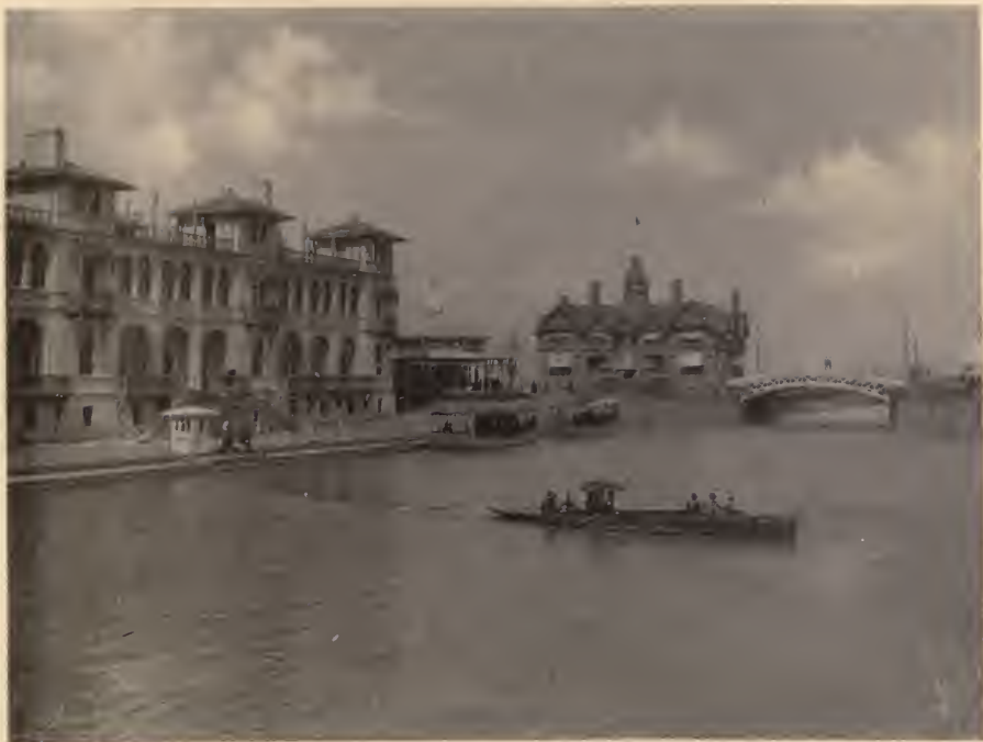
RHODE ISLAND CLAMBAKE AND VICTORIA BUILDING.