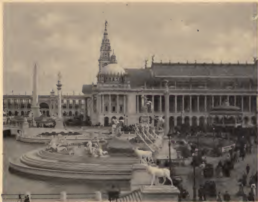
UPPER BASIN, OBELISK, MACHINERY HALL AND COLUMBIA FOUNTAIN.