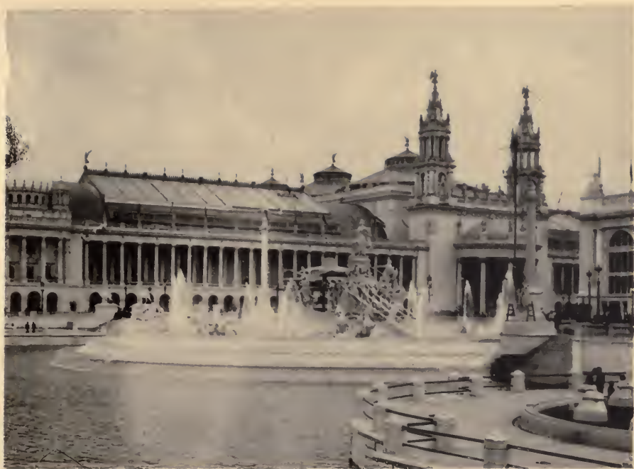
MACHINERY HALL AND COLUMBIA FOUNTAIN.