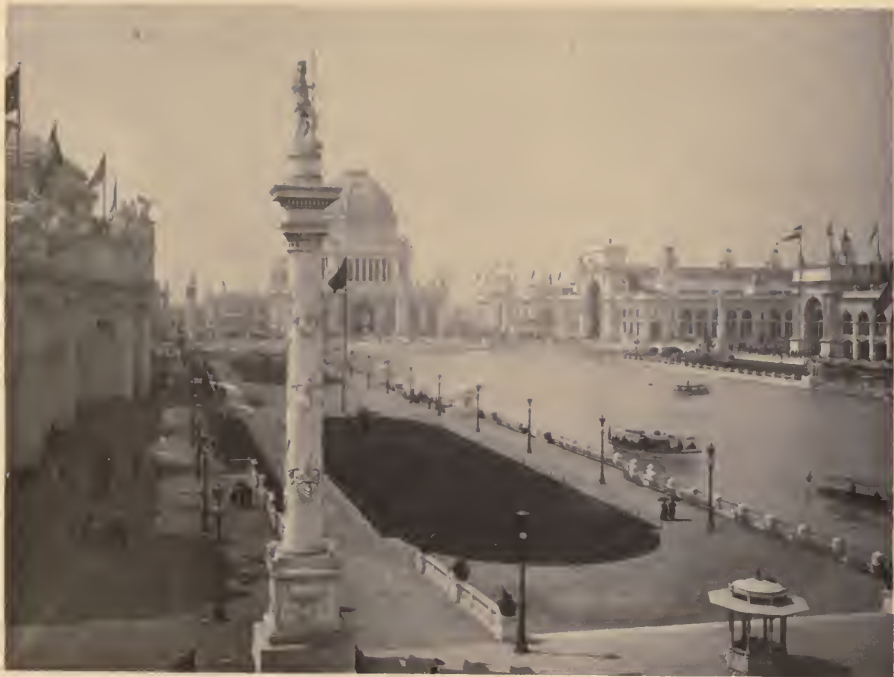
GRAND CENTRAL COURT.