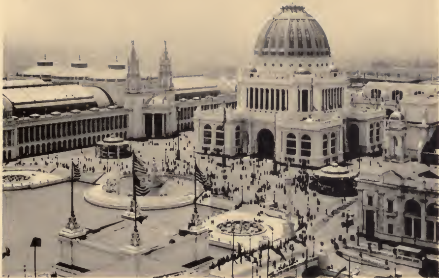
MACHINERY HALL, ADMINISTRATION BUILDING AND COURT OF HONOR.