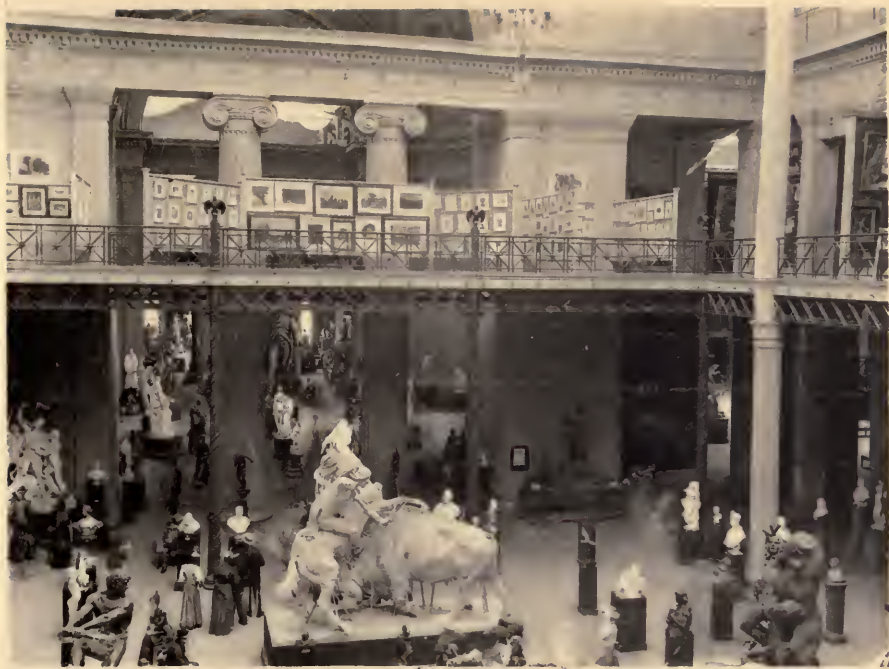
INTERIOR—THE ART PALACE.