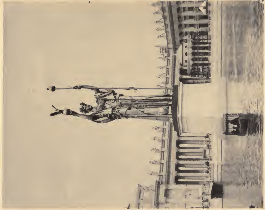
STATUE OF THE REPUBLIC.