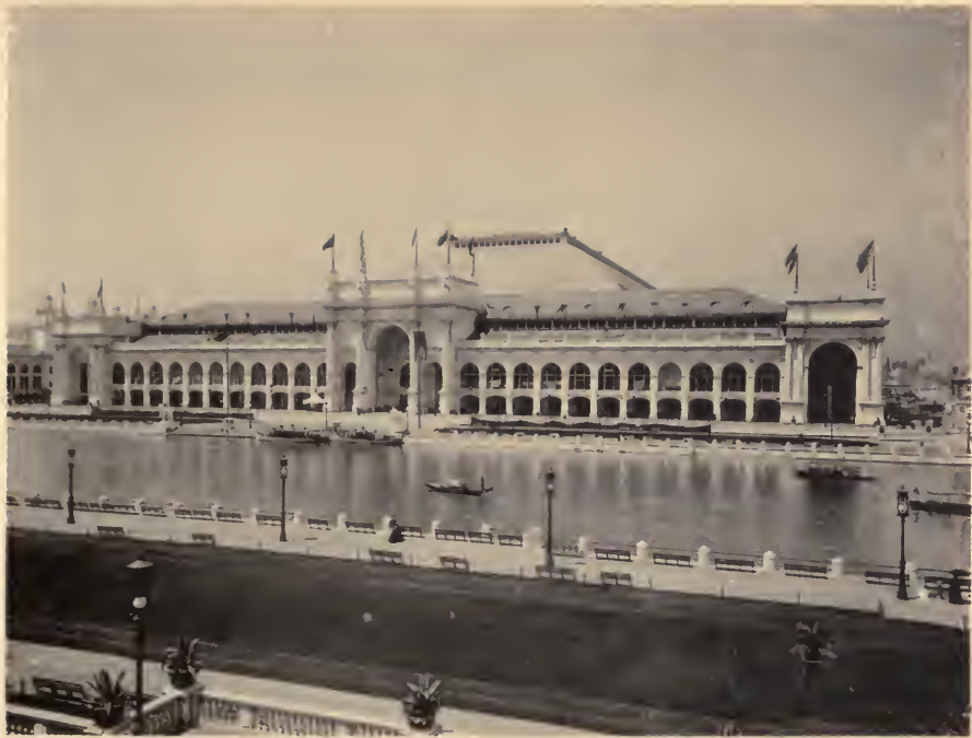
MANUFACTURES AND LIBERAL ARTS BUILDING AND BASIN.