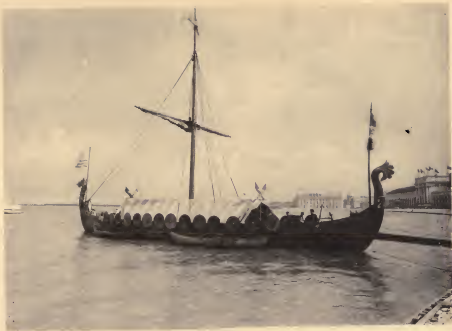
THE VIKING SHIP.