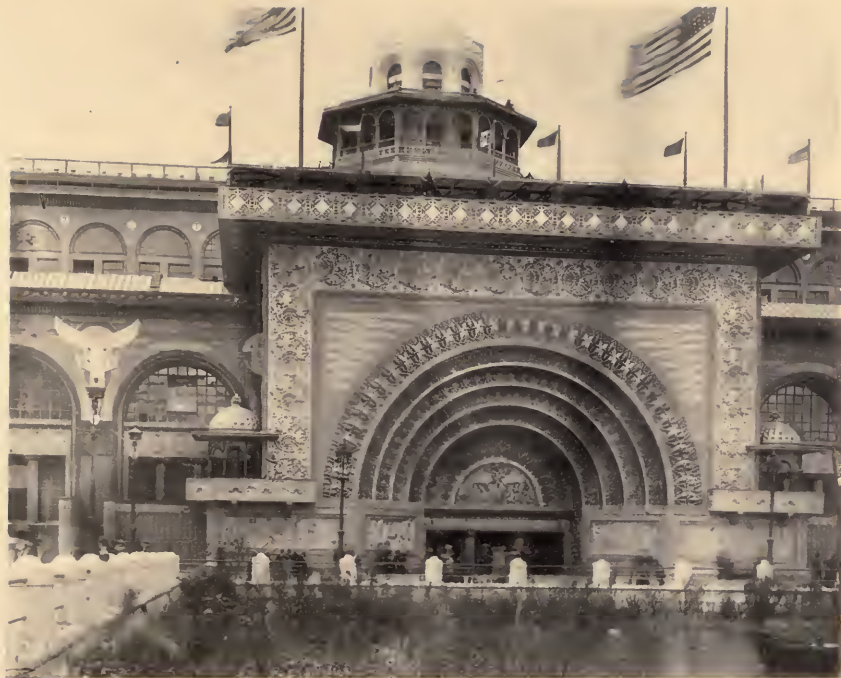
THE GOLDEN GATE OF THE TRANSPORTATION BUILDING.