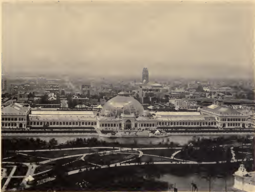
HORTICULTURAL BUILDING AND WOODED ISLAND, MIDWAY PLAISANCE IN THE DISTANCE.