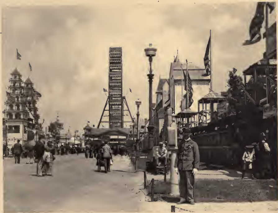
THE CHINESE PAGODA, FERRIS WHEEL, OLD VIENNA AND DAHOMEY VILLAGE.