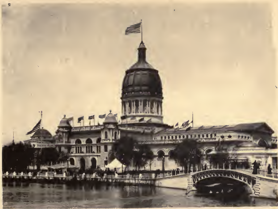
THE ILLINOIS STATE BUILDING.