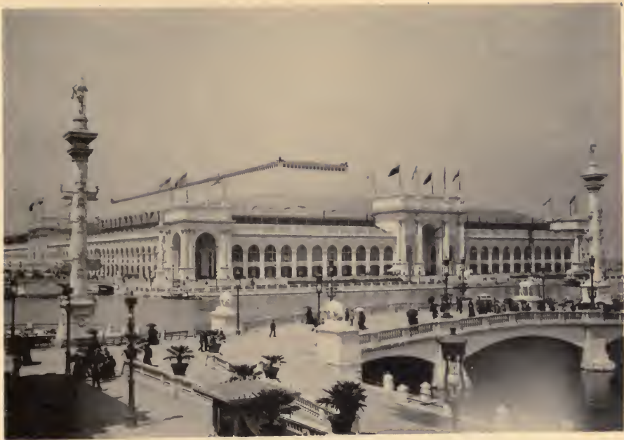
MANUFACTURES AND LIBERAL ARTS BUILDING.