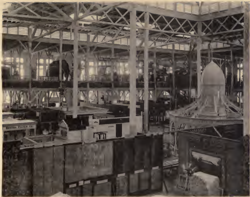
MUSEUM OF ARCHAEOLOGY, ETHNOLOGY AND ANTHROPOLOGY.