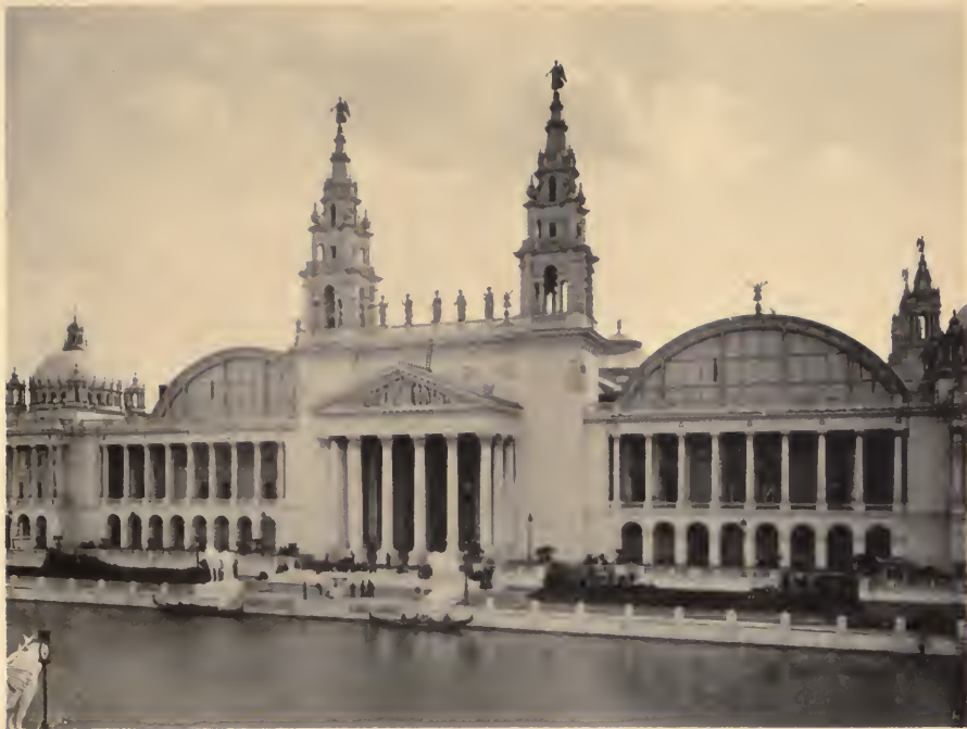
MACHINERY HALL—EAST FRONT.