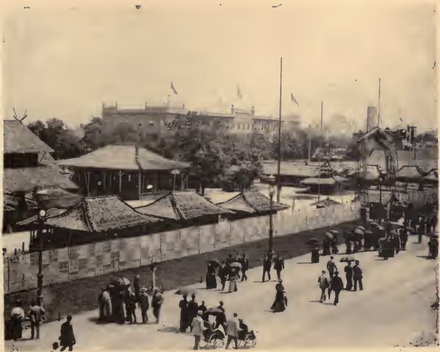
JAVANESE VILLAGE—MIDWAY PLAISANCE.