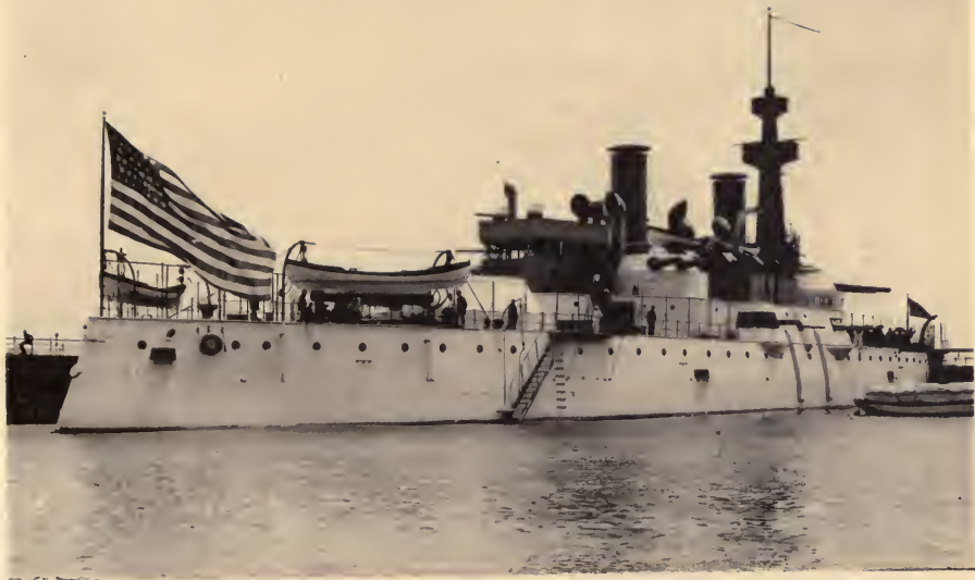
THE BATTLESHIP "ILLINOIS."