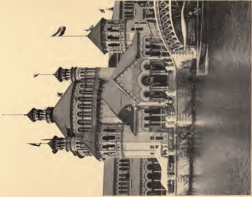
EAST PORTICO OF THE FISHERIES BUILDING.