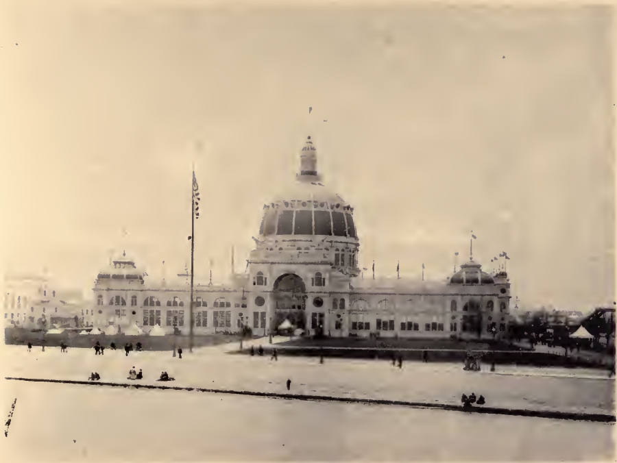
U. S. GOVERNMENT BUILDING.