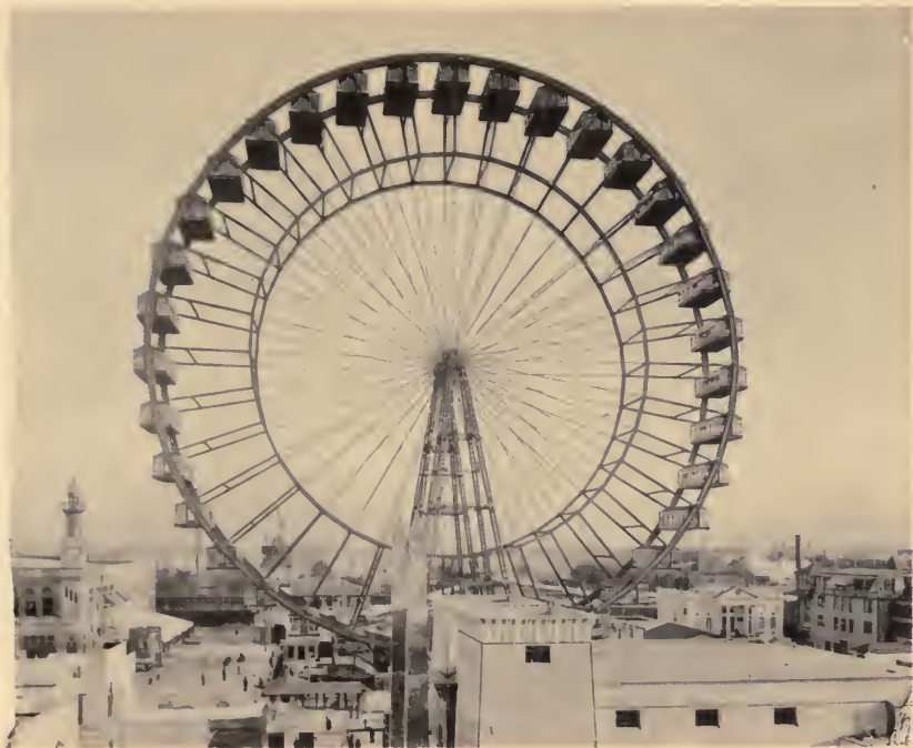
THE FERRIS WHEEL AND STREET IN CAIRO.