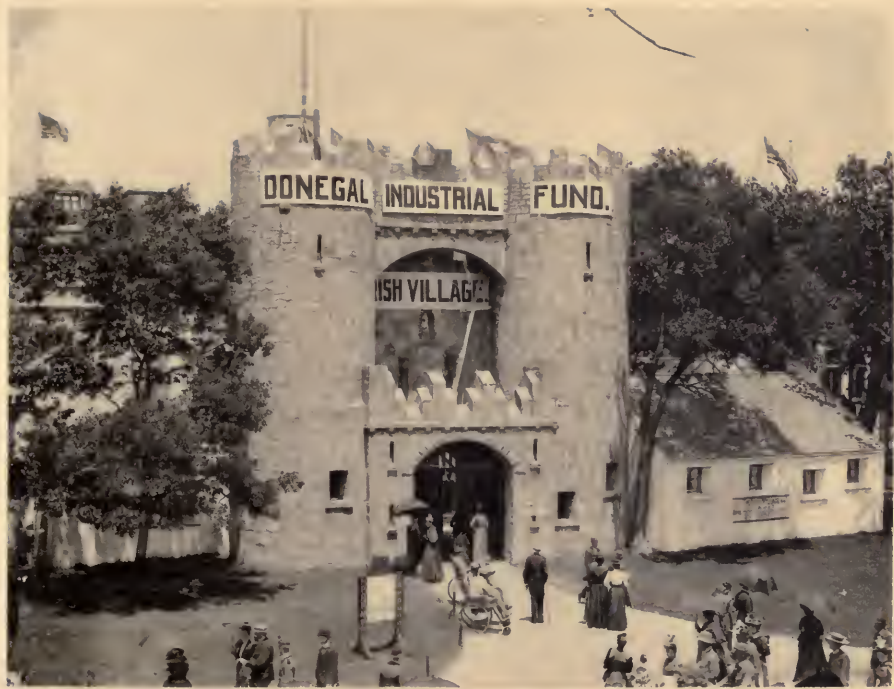
THE IRISH VILLAGE - MIDWAY PLAISANCE.