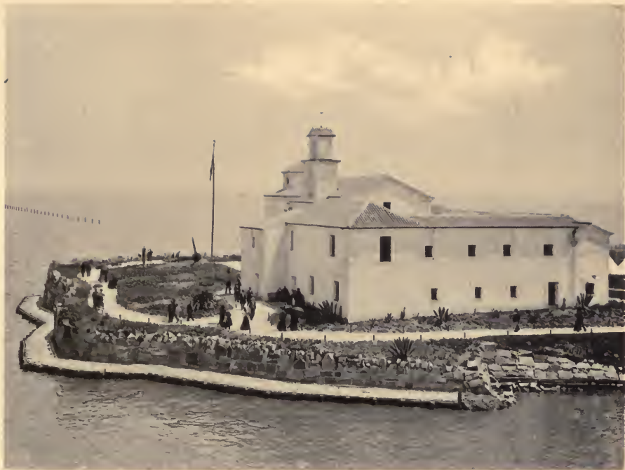
MONASTERY OF "LA RABIDA," WHENCE COLUMBUS SAILED TO DISCOVER AMERICA.