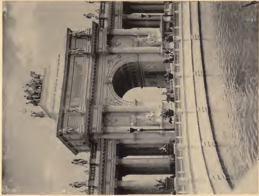
EULALIA ARCH AND COLUMBUS QUADRIGA.