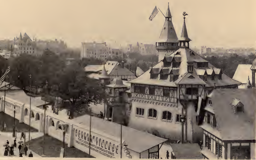
THE GERMAN VILLAGE—MIDWAY PLAISANCE.