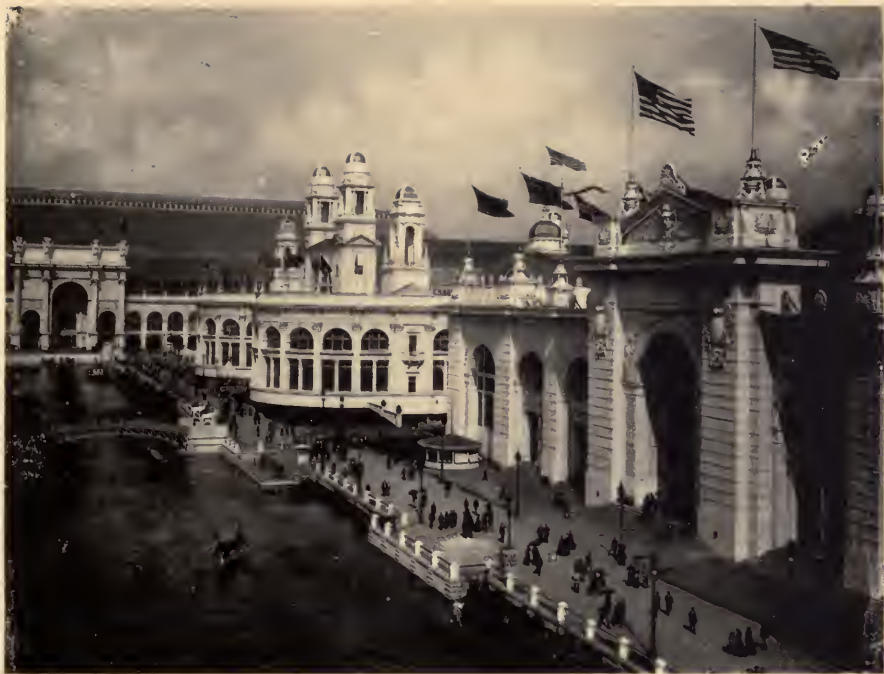
MANUFACTURES, ELECTRICAL AND MINING BUILDINGS.