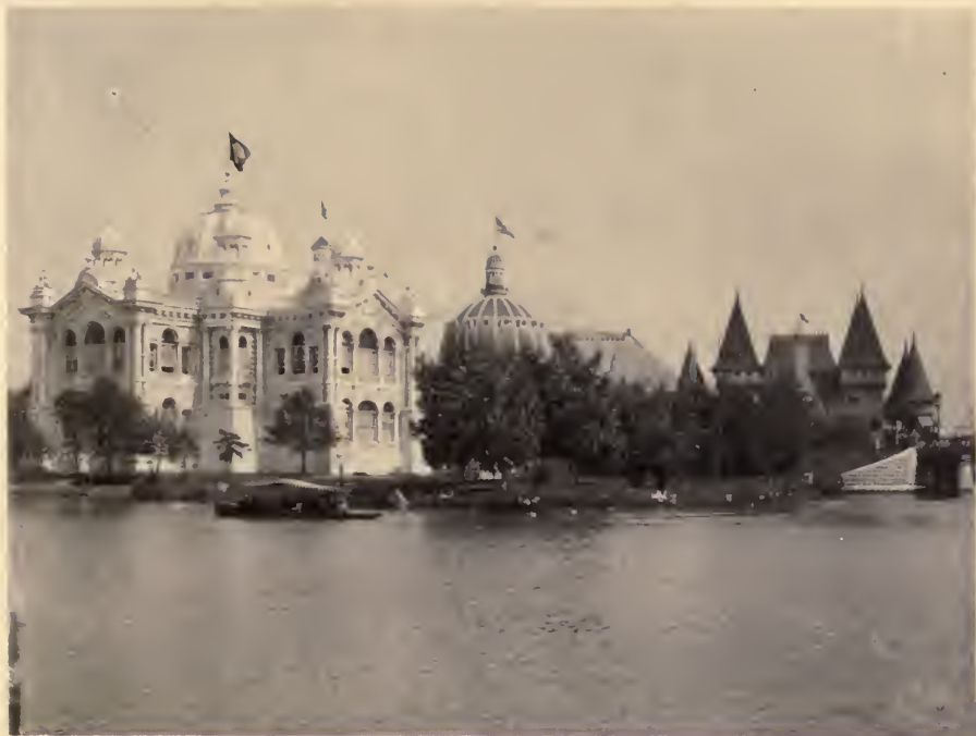
THE BRAZILIAN BUILDING AND MARINE CAFE.