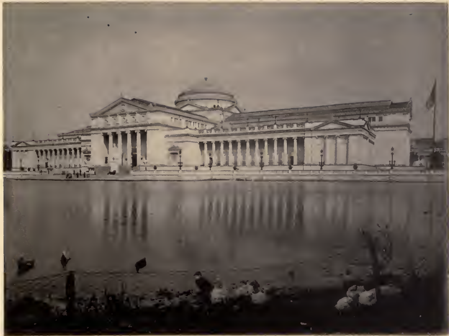
THE ART PALACE.