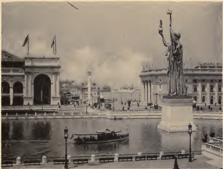
MAIN ENTRANCE OF ELECTRICAL BUILDING AND COURT OF HONOR.