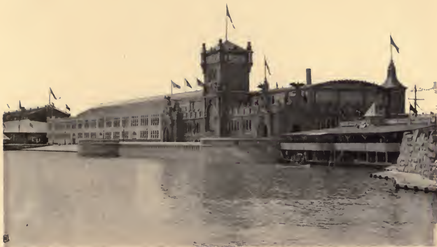
FORESTRY, LEATHER AND KRUPP BUILDINGS.