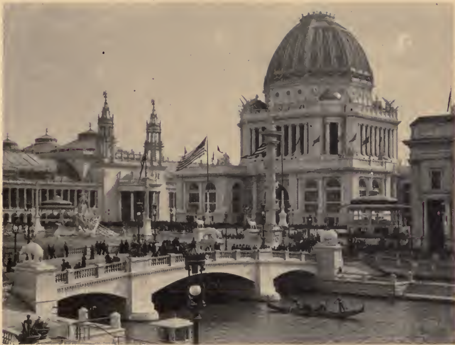
THE ADMINISTRATION BUILDING.