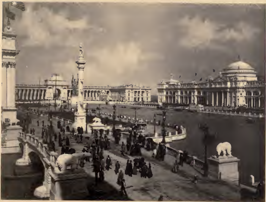
COURT OF HONOR AND CENTRAL BASIN.