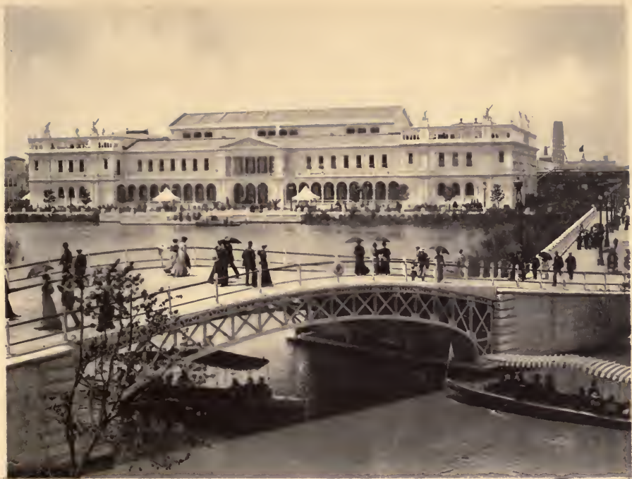
THE WOMAN'S BUILDING.