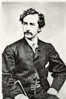
John Wilkes Booth