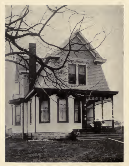
WEST HOME. Kinmundy, Illinois.