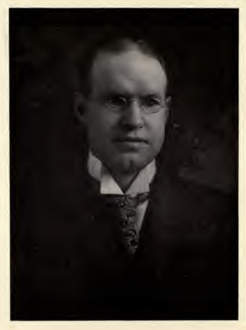
AV.T. in ley