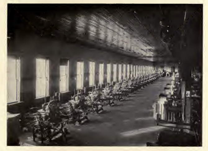
CENTRALIA ENVELOPE CO.