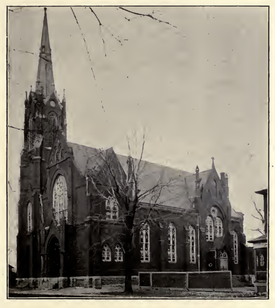
ST. MARY'S CATHOLIC CHURCH. Centralia, Illinois.