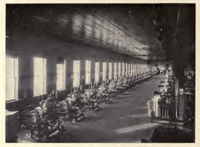
CENTRALIA ENVELOPE CO.