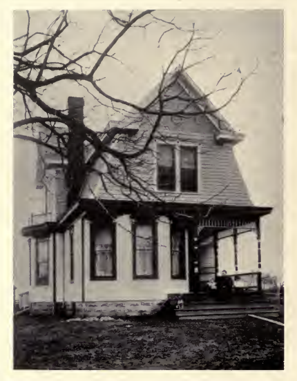
WEST HOME. Kinmundy, Illinois.