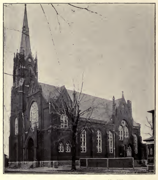
ST. MARY'S CATHOLIC CHURCH. Centralia, Illinois.