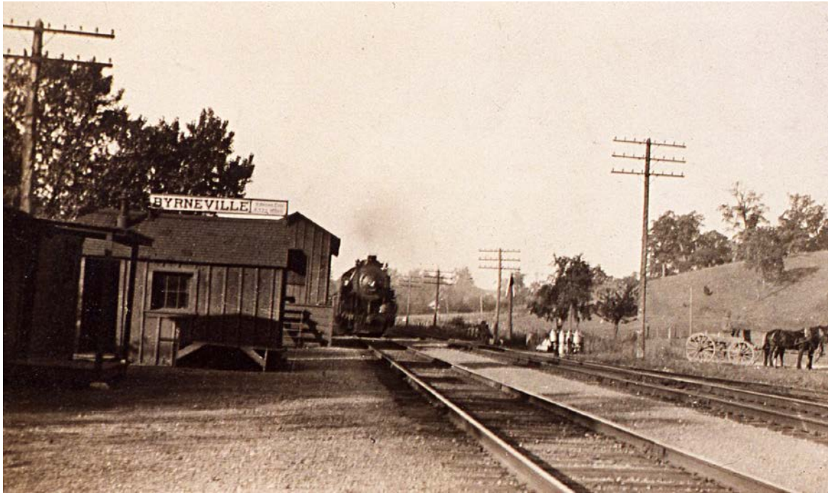
A train approaches the Byrneville Station to make a brief stop to pick up milk and other goods that the area's farmers sent to market.

Illinois History Store® – Vintage Illinois and Chicago logo products.