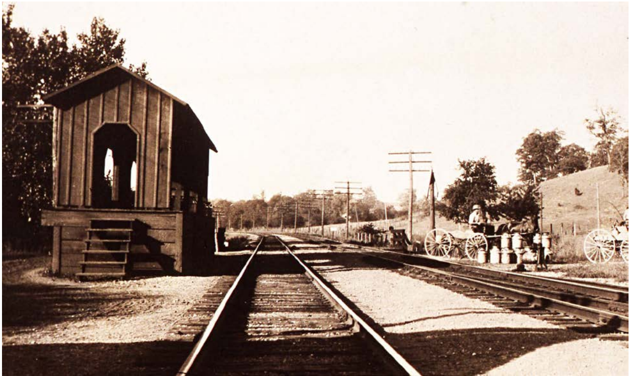
A dairy farmer awaits the oncoming train which will pick up his milk cans for delivery to Chicago, Illinois.