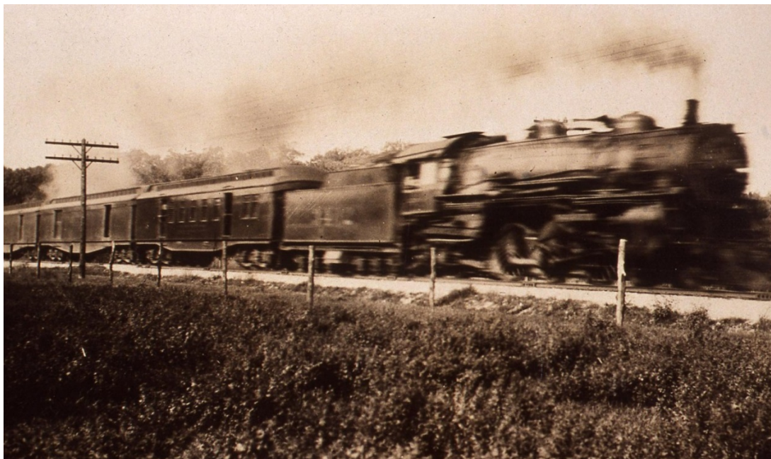
A train leaves Byrneville after making a quick stop to pick up milk from the area's dairy farmers.