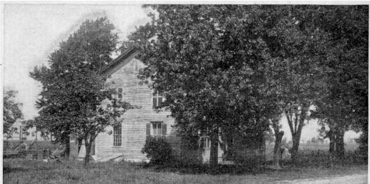
All that is left of Coltonville, DeKalb Township, the site of the first court house of DeKalb County. Court was held in a log cabin