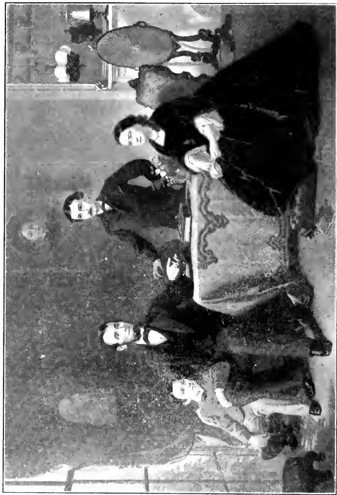
Abraham Lincoln and his Family Reproduced from an Engraving by William Sartain.