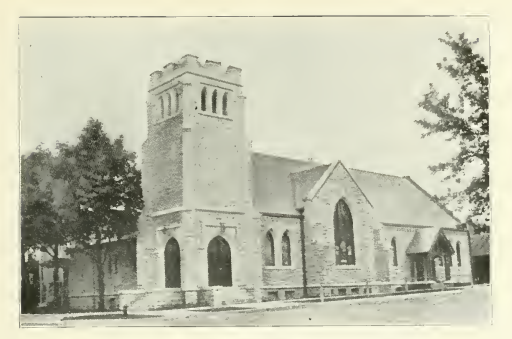
FIRST CONGREGATIONAL CHURCH, NAPERVILLE