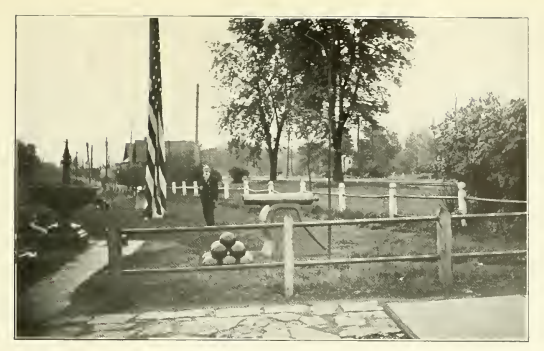
SCENE AT GLEN ELLYN