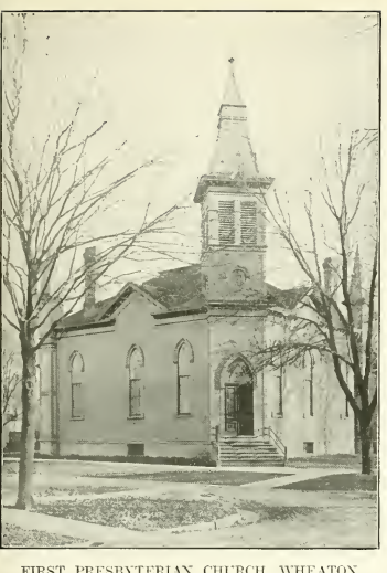
FIRST PRESBYTERIAN CHURCH, WHEATON.