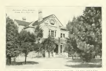
SALVATION ARMY CHILDRENS' HOME, GLEN ELLYN