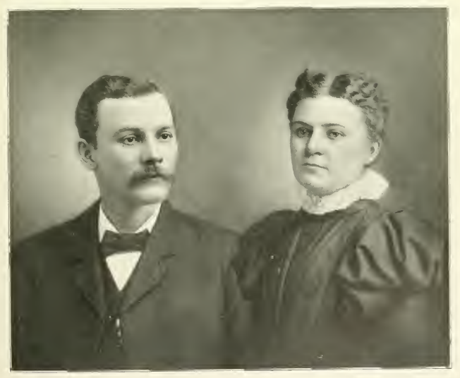
Om: Ours On & Wurty and Home