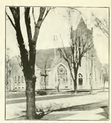
FIRST BAPTIST CHURCH, WHEATON.