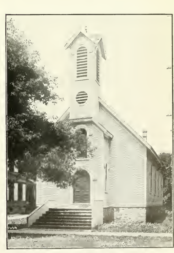
FIRST CHURCH OF CHRIST, SCIENTIST, WHEATON