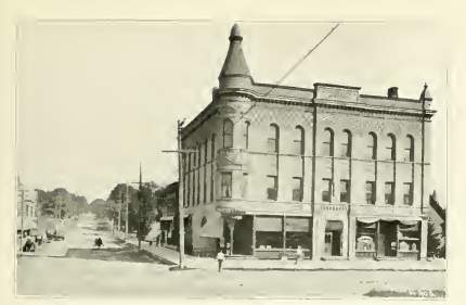
MAIN STREET NORTH FROM DELAVAN, GLEN ELLYN