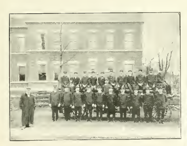
WHEATON FIRE DEPARTMENT.