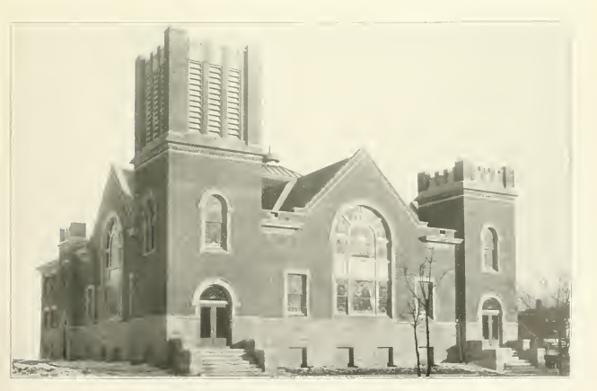
FIRST EVANGELICAL CHURCH, NAPERVILLE