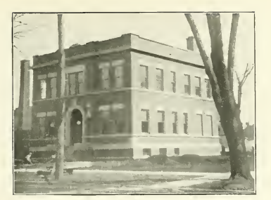
CITY HALL, WHEATON.