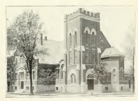
GRACE UNITED EVANGELICAL CHURCH, NAPERVILLE