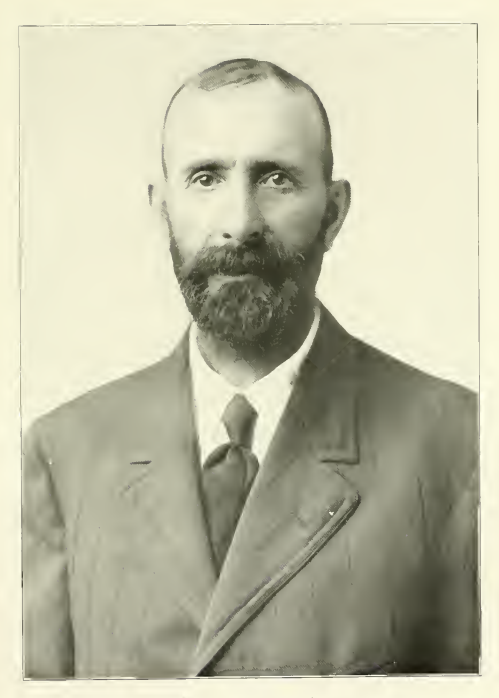
Zeanle. X. Wineleles