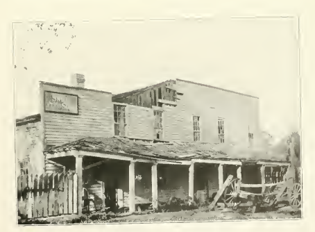
OLD TAVERY, FULLERSBURG.