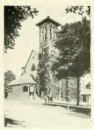
CONGREGATIONAL CHURCH, HINSDALE