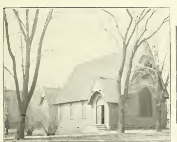
EPISCOPAL CHURCH, WHEATON,