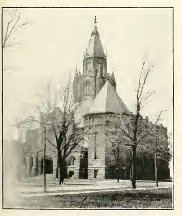
GARY MEMORIAL M. E. CHURCH, WHEATON,