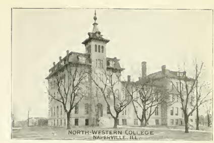
NORTH-WESTERN COLLEGE, NAPERVILLE