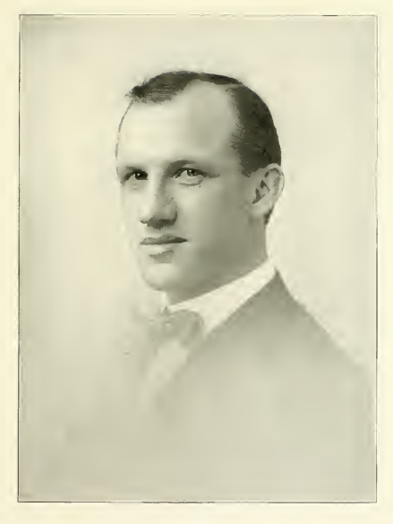
6 has 6. Baker.