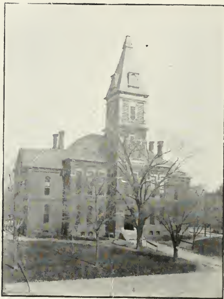
COURT HOUSE, MOUNT VERNON.