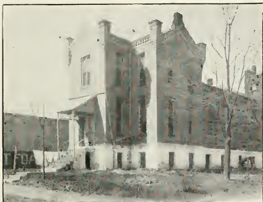
COUNTY JAIL, MOUNT VERNON.