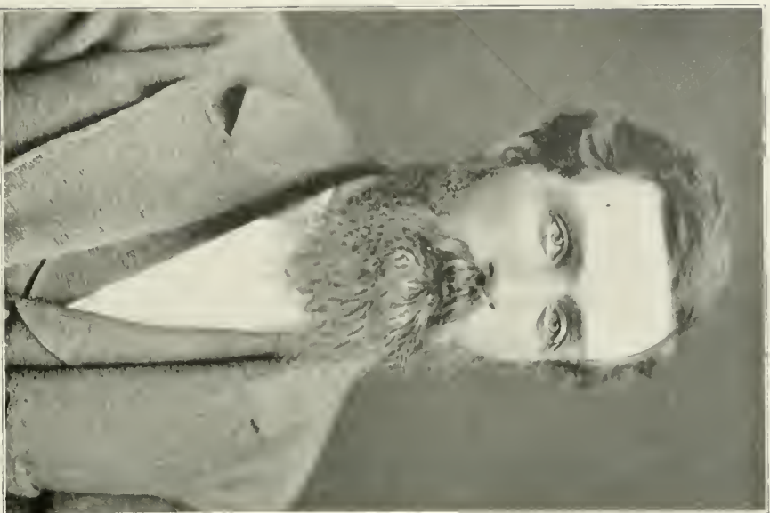
W. H. H. H.