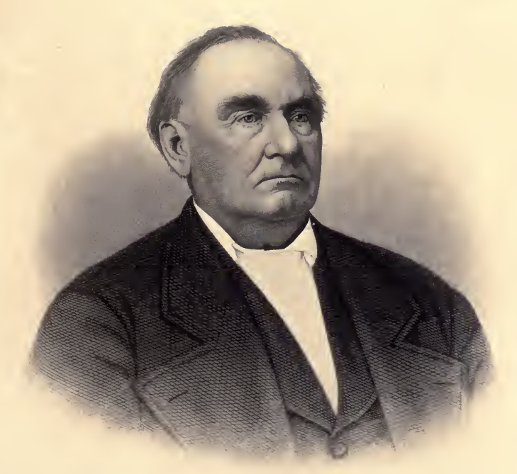
Englishy HB Hall & Sons. 13 Barday St. MY.