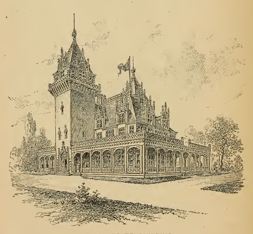
INDIANA STATE BUILDING.