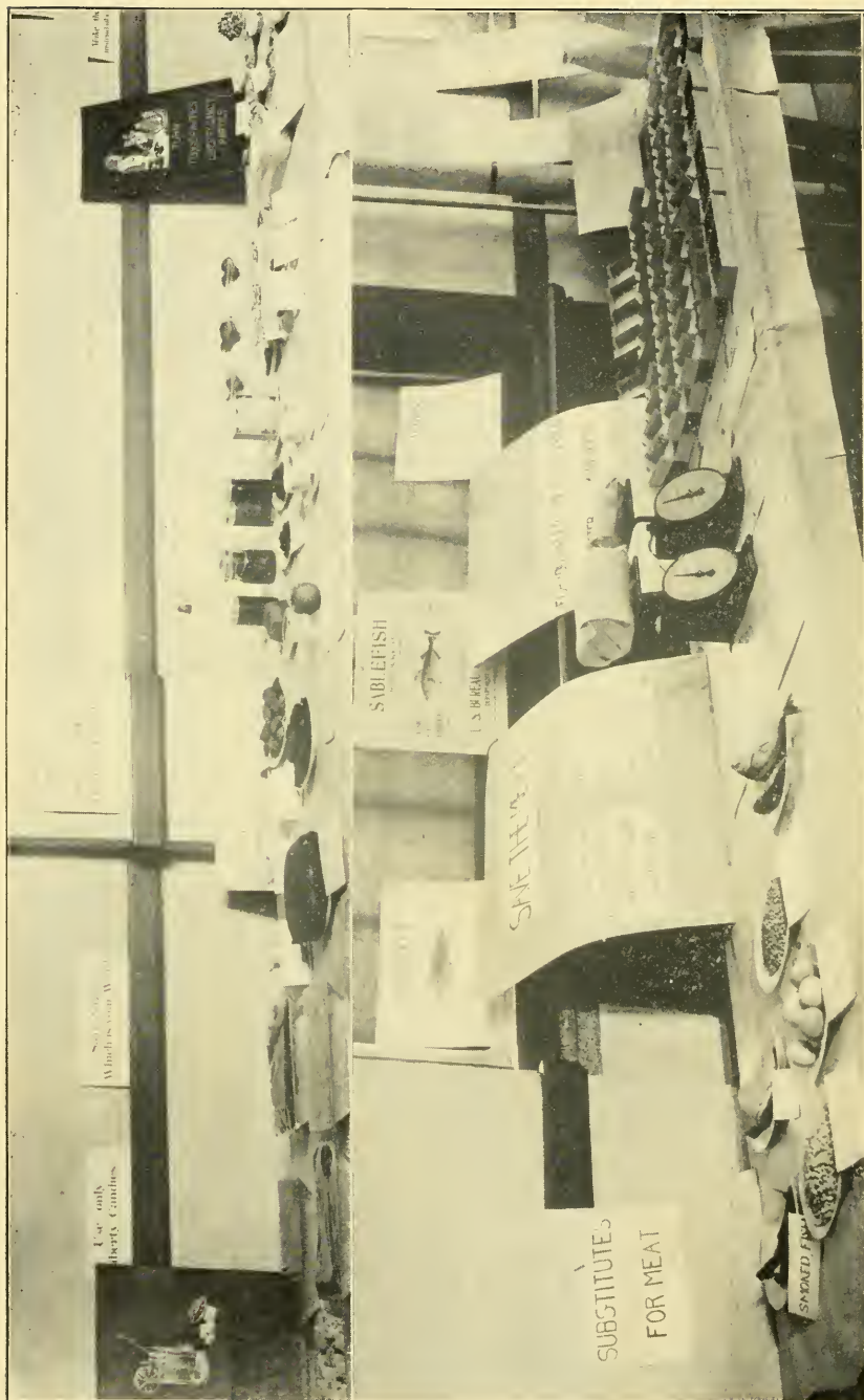
Liberty candies and sugarless sweets.