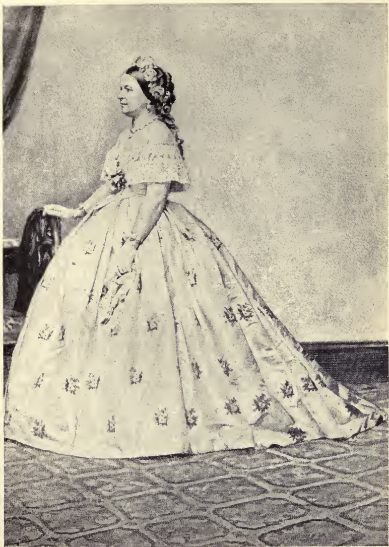
Mary Todd Lincoln