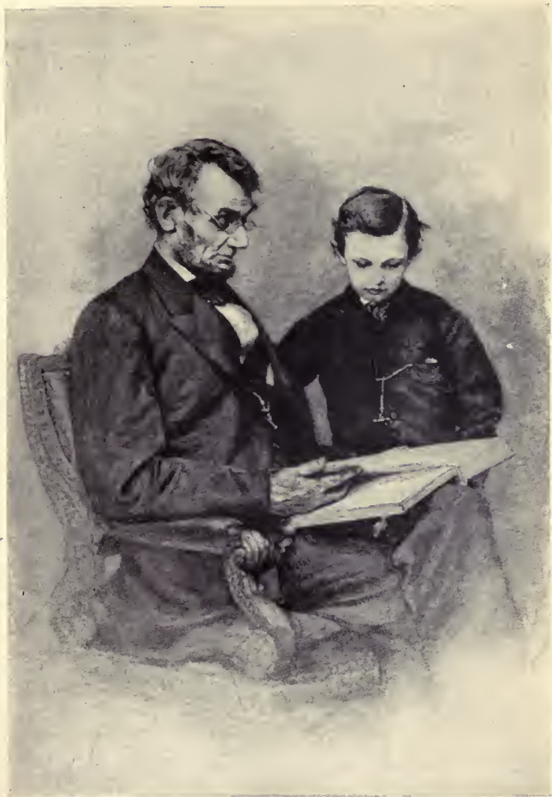
Lincoln and Tad