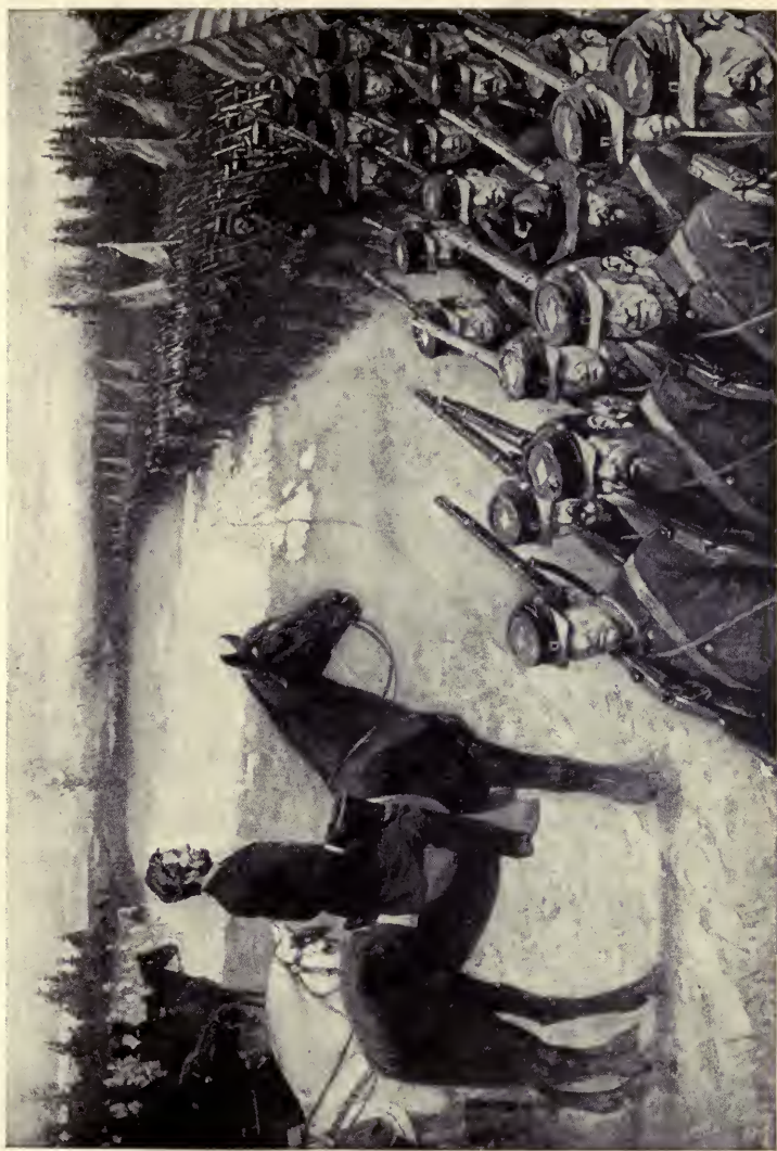
Review of the Army of the Potomac, Falmouth, Virginia, April 1862