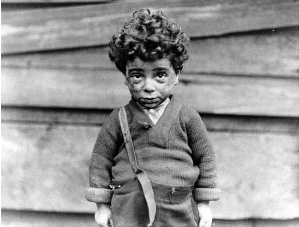
Italian American boy, c.1902, Chicago. Probably taken in the Little Hell neighborhood.

Illinois History Store® – Vintage Illinois and Chicago logo products.