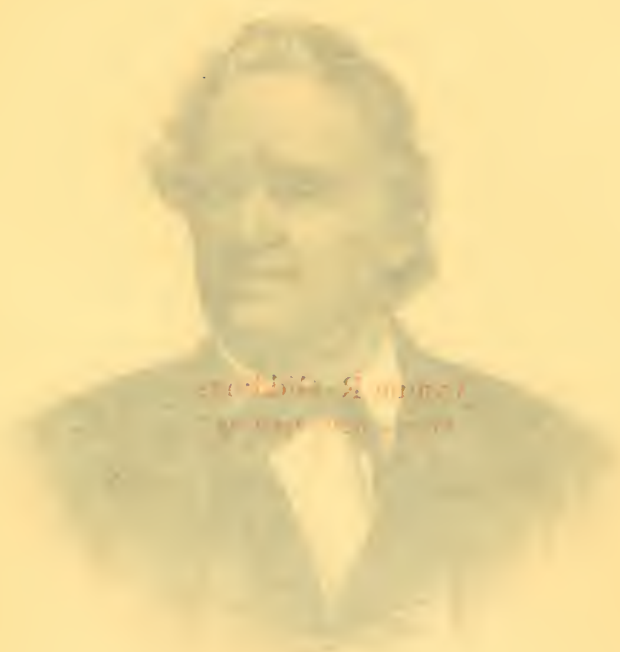
Portrait of a man, likely a historical figure, wearing a suit and tie.