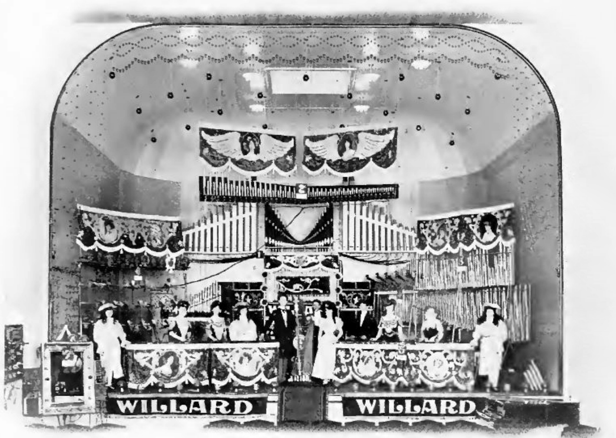
Interior View of Temple of Music

Bogascheque cocoanuts, each one having a comic face carved on it. This will be a great laugh producer.