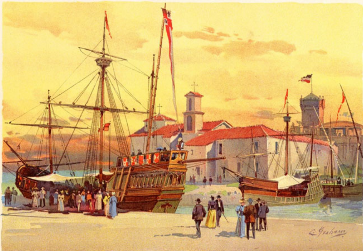
THE CARAVELS AND LA RABIDA.

An exhibition of the scientific, liberal and mechanical arts of all nations, held at Chicago, between May 1 and Oct. 31, 1893. The project had its inception in November, 1885, in a resolution adopted by the directorate of the Chicago Inter- State Exposition Company. On July 6, 1888, the first well defined action was taken, the Iroquois Club, of Chicago, inviting the co-operation of six other leading clubs of that city in “securing the location of an international celebration at Chicago of the 400th anniversary of the discovery of America by Columbus.”